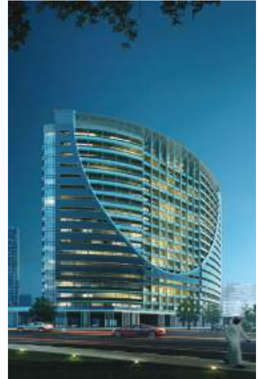
The V Tower