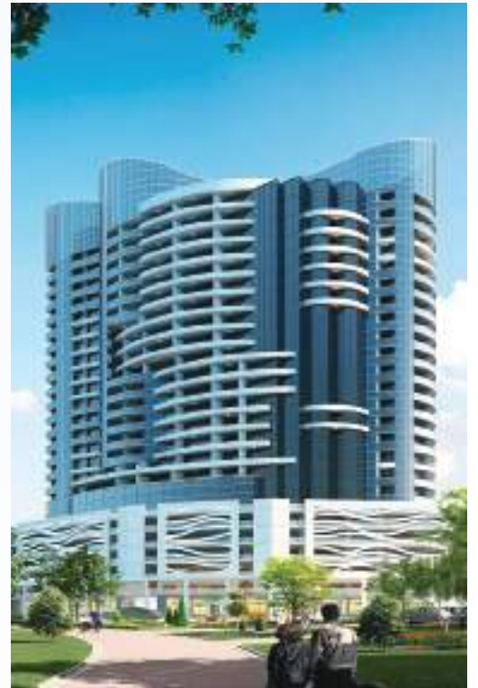
Blue Waves Tower