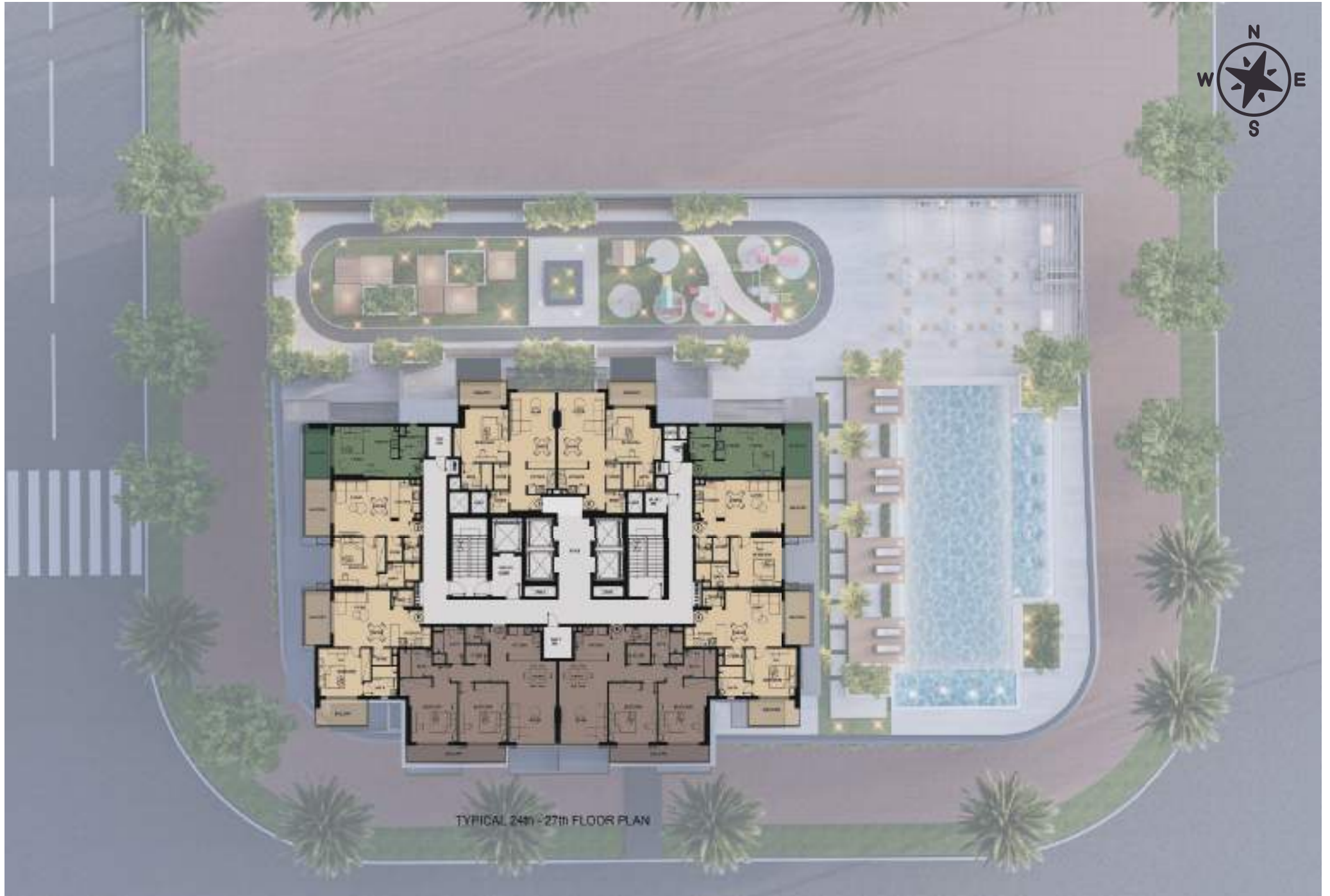
TYPICAL 24th - 27th FLOOR PLAN