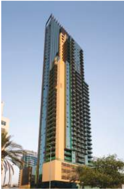
The Square Tower